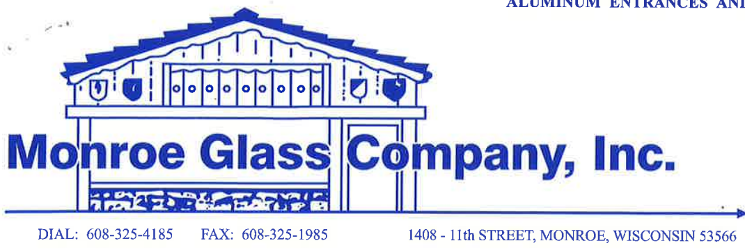
PLATE GLASS - WINDOW GLASS - AUTO GLASS INSTALLED ALUMINUM ENTRANCES AND STOREFRONTS - MIRRORS