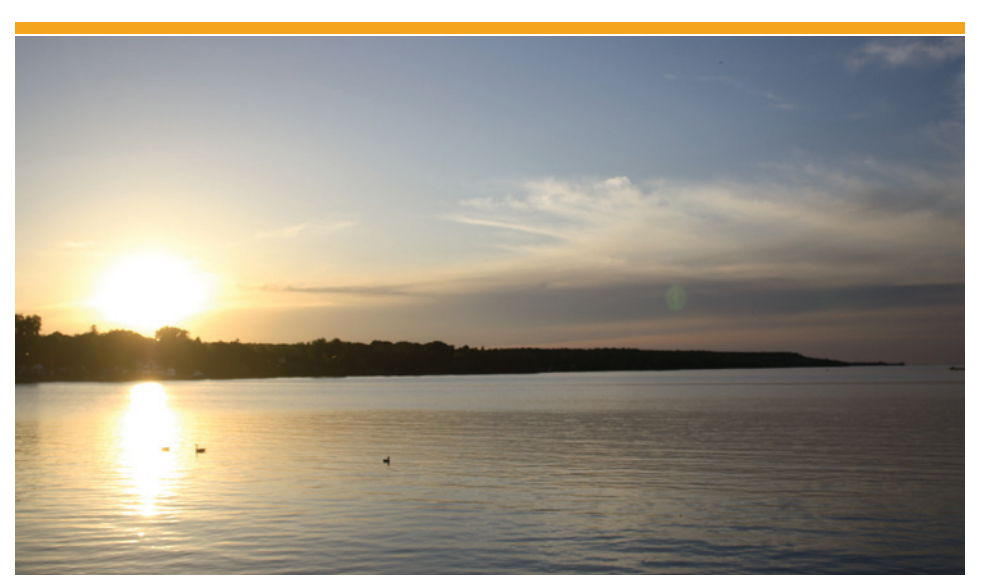
The sun sets over the waterfront near Michigan Street Bridge.

"In the spirit of joint action, it makes sense for me to give back to the entity that supports us in so many ways – and to have a say in the organization. It's common sense and good management," he said.