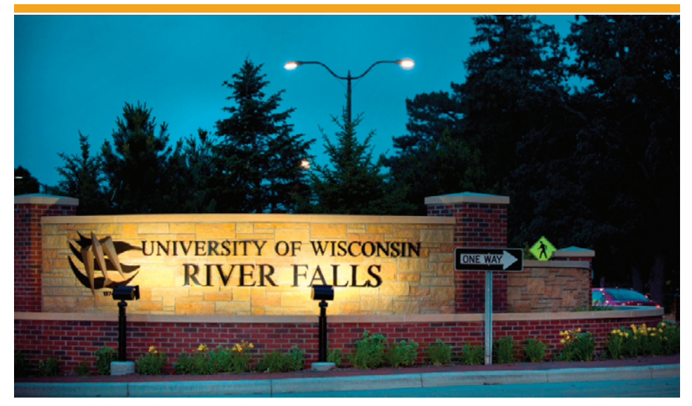
Thanks to the support of UW-River Falls students, the University Center and all residence halls on campus are powered by renewable energy through the Green Power for Business program offered by River Falls Municipal Utilities.

The U.S. Energy Information Administration predicts that in 2014, renew-