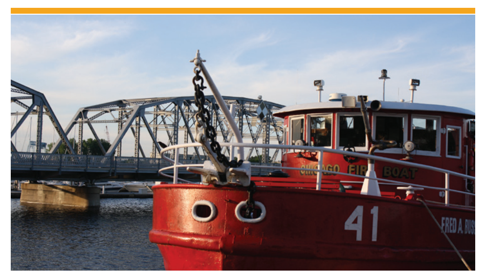
A historic fire boat is on display near the Michigan Street Bridge.

three Coast Guard detachments, bringing many service members and their families to the community.