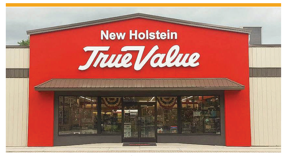
New Holstein True Value will save an estimated $3,000 per year after updating to LED T8 tube lighting.

of electricity annually, for an estimated cost savings of about $14,000 per year. Plymouth Utilities, through WPPI Energy's Utility and Municipal Building Efficiency program, is providing financial assistance, as is the state's Focus on Energy program.