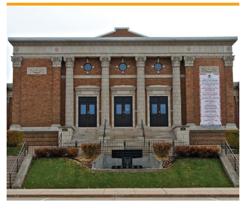
Waupun's City Hall.

"We want to see the community succeed, and I think a strong utility is the foundation of the success of the community," says Posthuma.