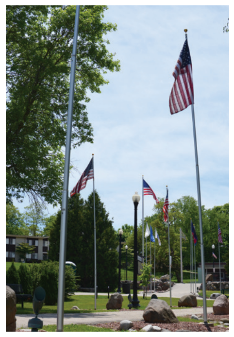
The city of Plymouth plans to upgrade 600 city street lights to LEDs by the end of 2017.

Many WPPI Energy members have helped upgrade some or all of their community's street lights to LEDs. One of these members is Plymouth Utilities, which is currently in the middle of an LED street lighting project. City officials plan to replace 600 100-watt HPS heads with 45-watt LED heads over a three year period (2015-2017). The upgrade is estimated to save the city approximately 221,900 kilowatt-hours (kWh)