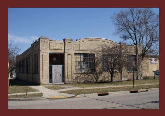
Upright Swiss Embroidery Factory, 1100 2<sup>nd</sup> Street, 1924

Ernest Thierstein's Chalet Emmental, 301 12<sup>th</sup> Avenue, 1948