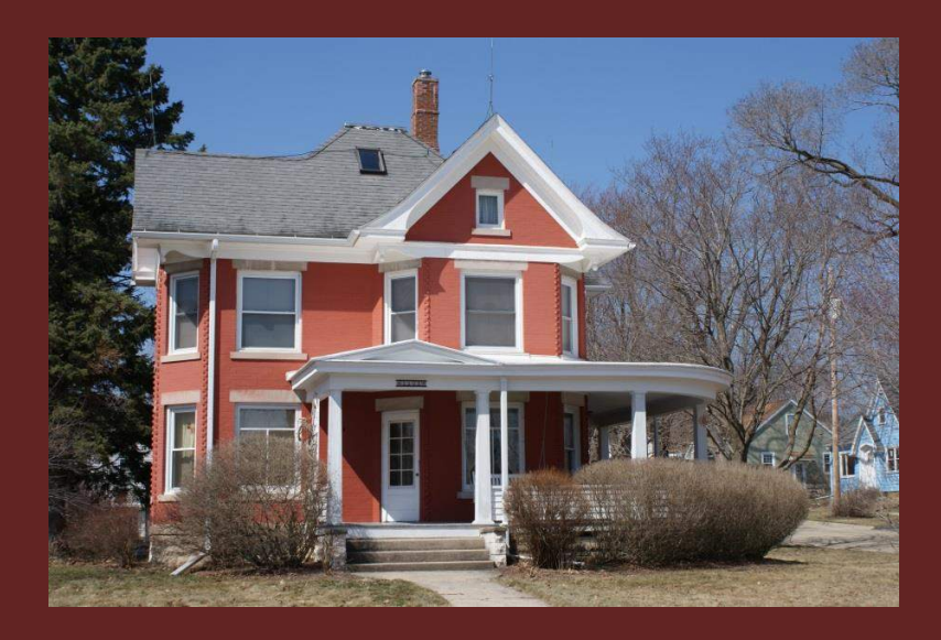
Albert Wittwer House, 1101 2<sup>nd</sup> Street, 1912, Builder: Oswald Altman

The following houses are mirror images of each other.