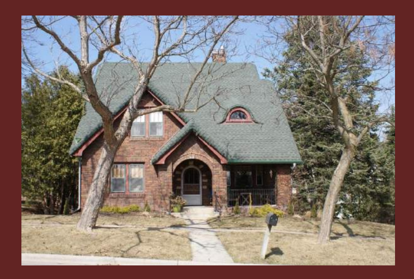
Elmer Figi House, 312 2<sup>nd</sup> Avenue, 1928, Builder: Oswald Altman Variation of the Tudor Revival style known as "Cotswold Cottage."