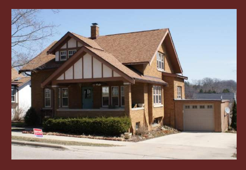
John Duerst House, 612 2<sup>nd</sup> Street, 1927, Builder: Oswald Altman

• Low horizontal form and massing, wide eaves with brackets, sloping roofline.