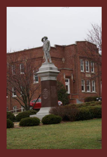
Pioneer Monument, 1915

Also included on the church site are the following: