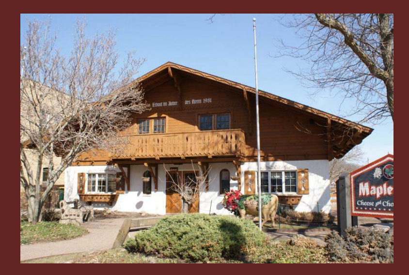
Retail Building (Old Gas Station), 554 1<sup>st</sup> Street, remodeled: 1981

Chalet Landhaus Inn, 801 Highway 69, 1980