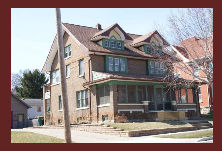
Dietrich Stauffacher House, 707 1<sup>st</sup> St., 1919