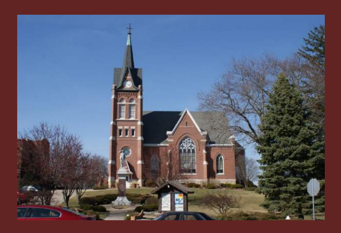
Swiss Evangelical and Reformed Church, 18 5<sup>th</sup> Avenue, 1900