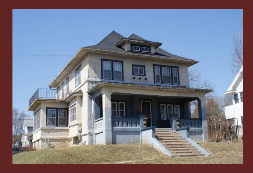
John Streiff House, 619 2<sup>nd</sup> Street, c.1919

• Square form, hip roof with wide eaves, front porch.