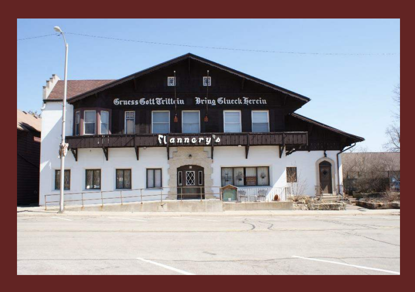
Old Wilhelm Tell Hotel, 114 2<sup>nd</sup> Street, 1900, Swiss Façade: 1964