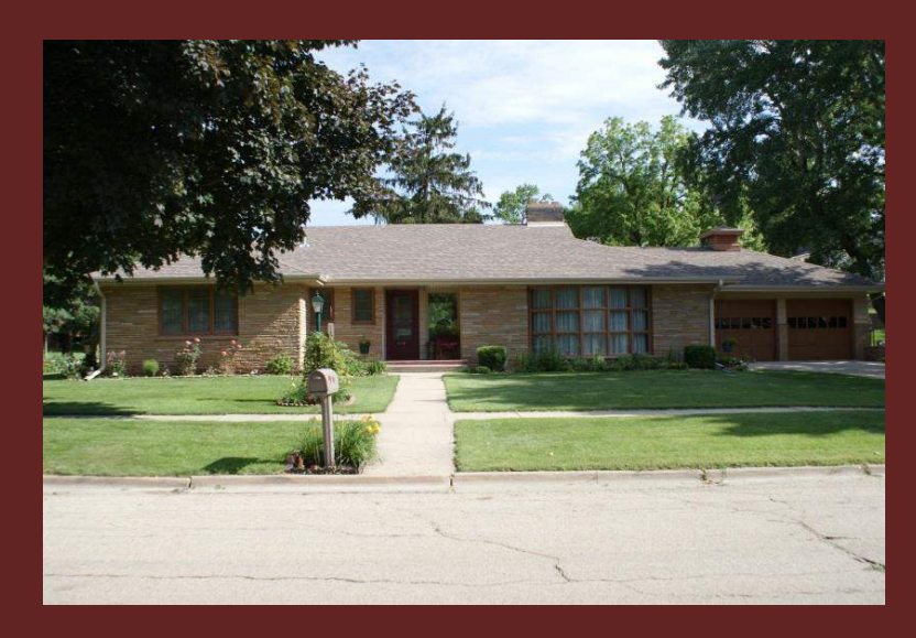
Edwin Christen House, 418 3<sup>rd</sup> Avenue, 1949