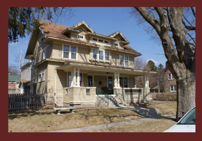
Swiss Reformed Church Parsonage, 300 3<sup>rd</sup> Avenue, 1914, Builder: Oswald Altman