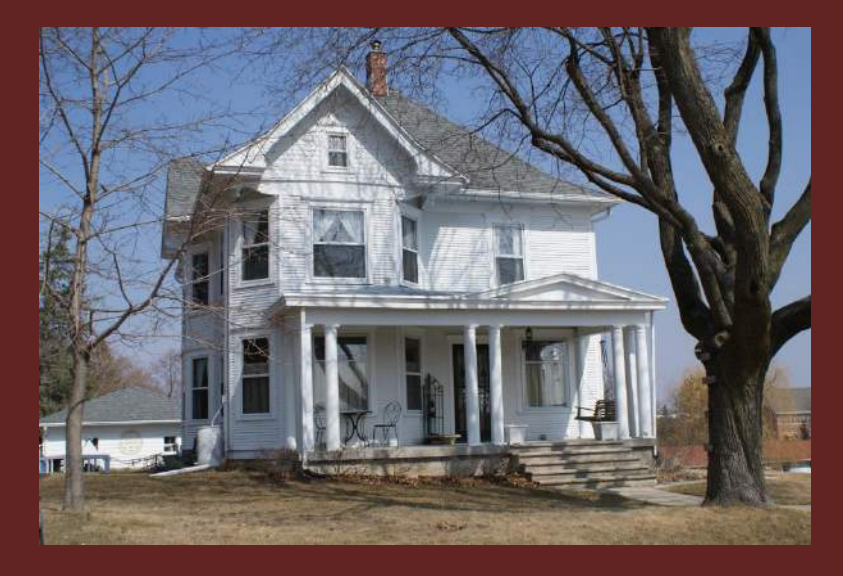
Casper Zwickey House, 600 9<sup>th</sup> Avenue, 1909, Builder: James Gross