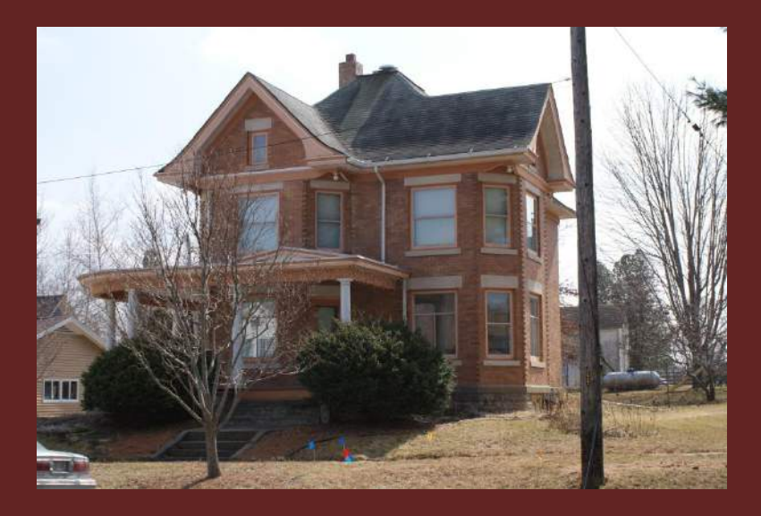
Henry Marty House, 113 8<sup>th</sup> Avenue, 1913