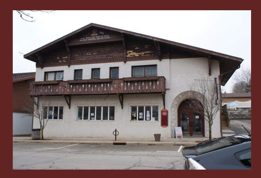
Hoesly & Hoesly Block, 109 5<sup>th</sup> Avenue, 1914, Swiss Façade: 1978