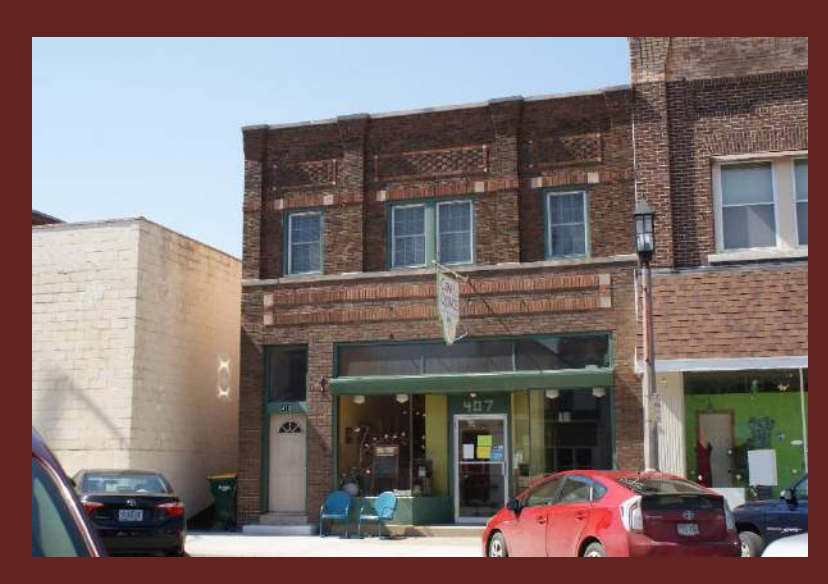
Stuessy Block, 407 2<sup>nd</sup> Street, 1929