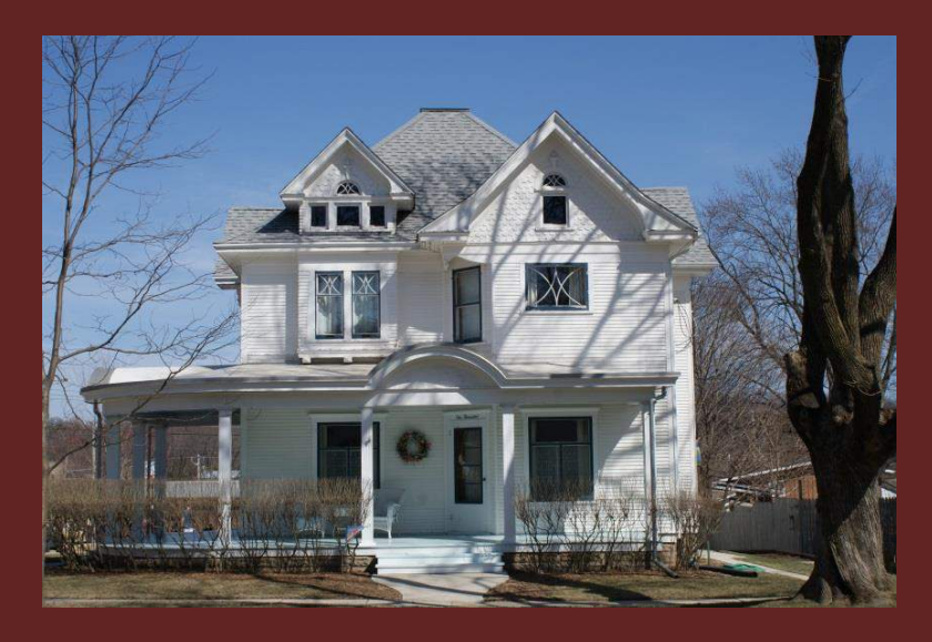
Sam Duerst House, 1000 1<sup>st</sup> Street, 1915, Builder: Oswald Altman An fine wood-clad example of the Queen Anne style.