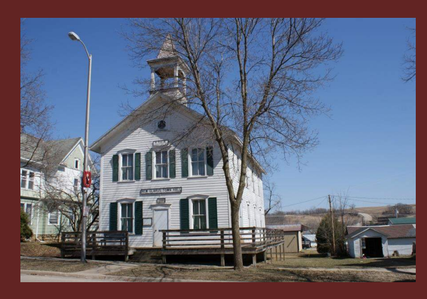
New Glarus Town Hall, 206 2<sup>nd</sup> Street, 1886; Listed 2008