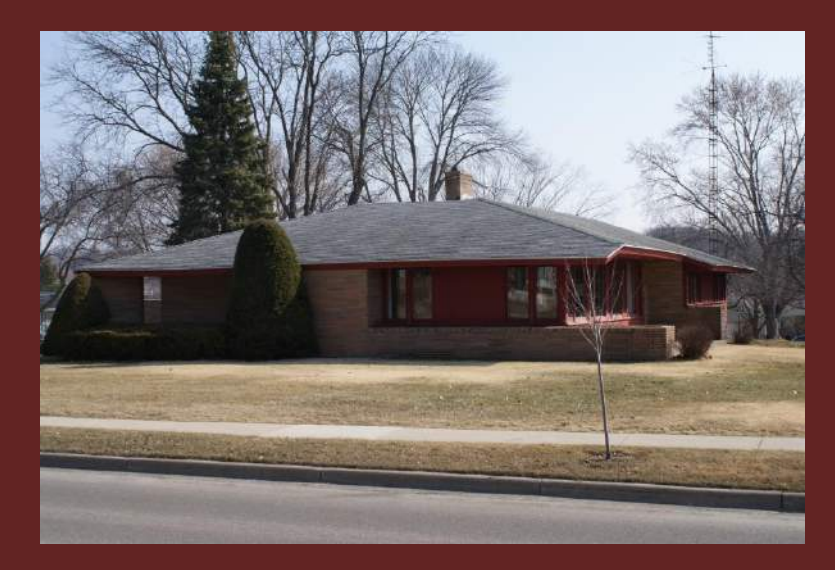
Ranch House, 318 11<sup>th</sup> Avenue

• Single story; long, rectangular plan; low-pitched hip or gable roof